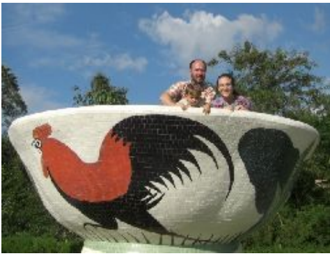
At the ceramics factory outlet in Lampang

The second most exciting news is that as of three weeks ago we now know where we will be moving to at the end of our year here in Lopburi. Before arriving at this decision with the national director of our organization, we took two vision field trips to visit teams we might possibly join. In October we boarded an over-night train and headed North to Lampang, a provincial capital located about one hour South-East of Chiang Mai. The team there has only been working together for less than a year and so far has established a community outreach centre as the base of their work. The main contact points with local people at this point in time are through teaching English classes and offering Kids' club activities but the vision is to see the centre expand to a place that will serve the community in a variety of ways as well as