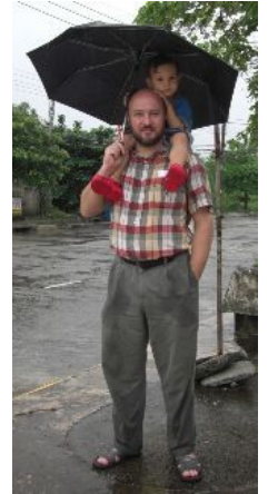
A rainy ride