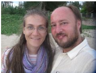
Our 5th anniversary

Apart from these work-related trips, we had a family retreat/holiday in August to the beach on the Gulf of Thailand and during our Christmas break, a short but beautiful two-day getaway to an island South-East of Bangkok. Both of these times were wonderful family times of refreshment outside of the city where we enjoyed hikes, swimming, and playing in the sand as well as long conversations with each other and with friends. We even celebrated our 5 th anniversary at the end of August, walking in the